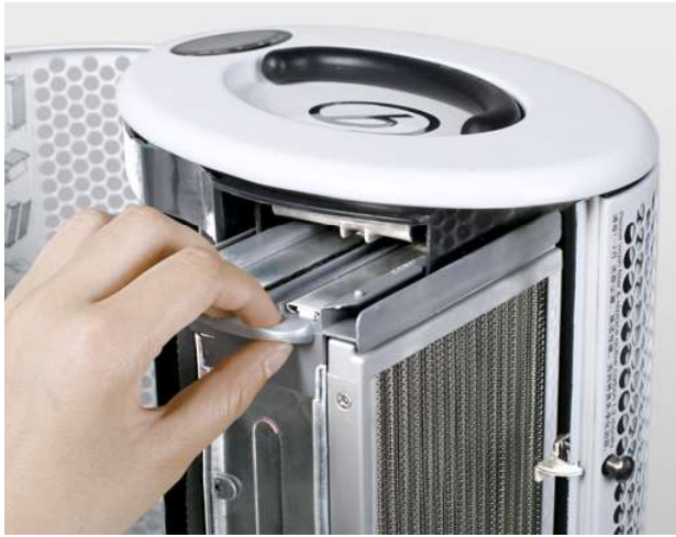
Take out the electrostatic cleaner