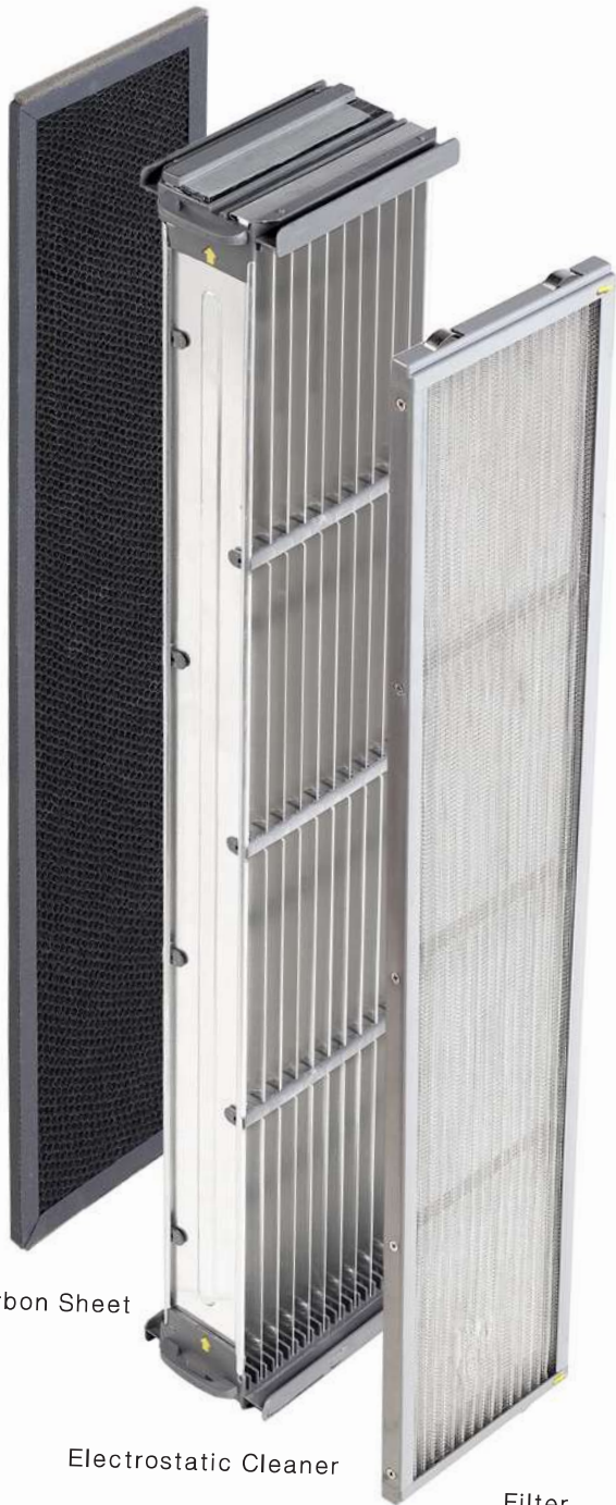
Active Carbon Sheet