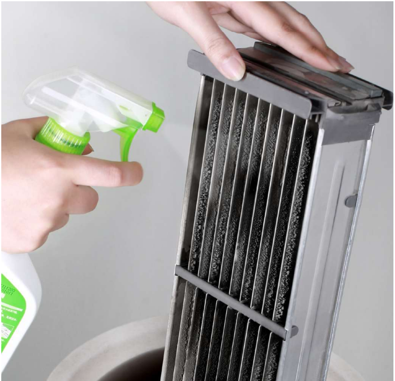
or use detergent to wash (commercially available)