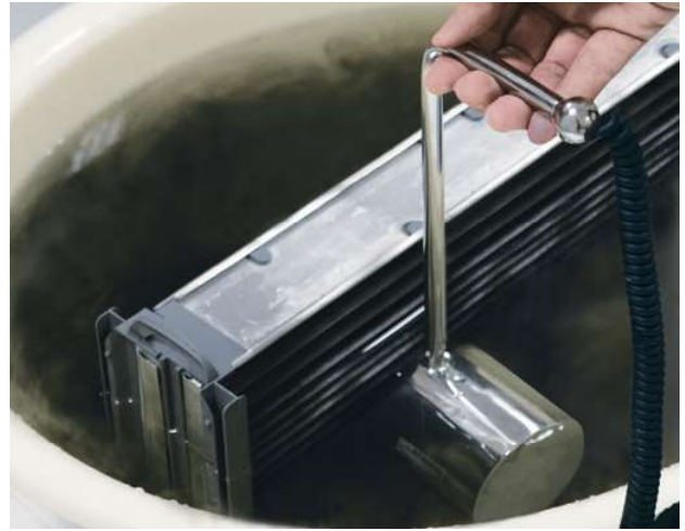
Use ultrasonic cleaning apparatus to wash (can be provided by BROAD)